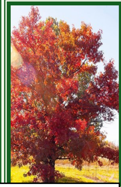
PIN OAK - FIRST EDITIONS® MAJESTIC SKIES™