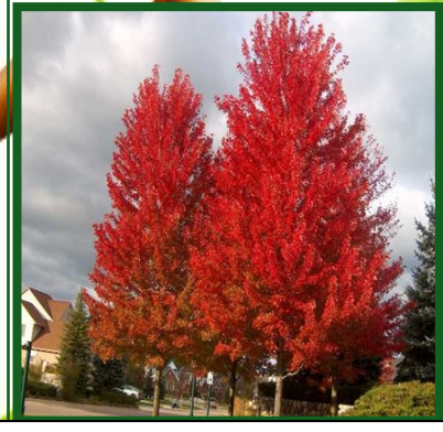
RED MAPLE – FIRST EDITIONS® MATADOR™